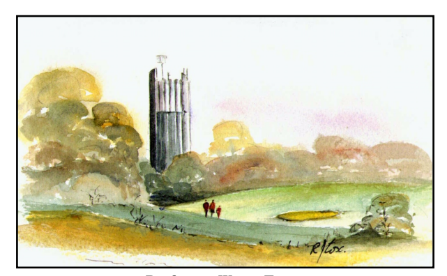
Rushmere Water Tower